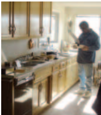
Tom in the Kitchen