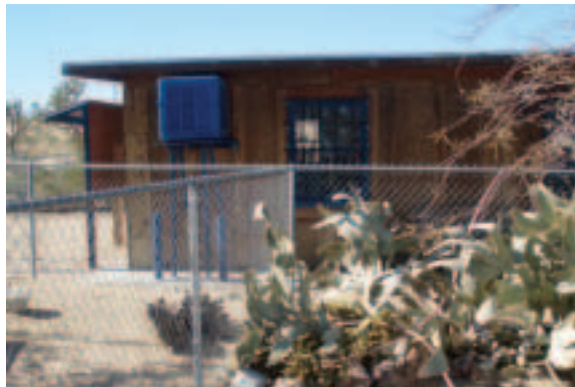
The old Landers Post Office behind the property