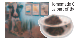
Homemade Cow Chips as part of the display

MUSEUM HOURS Tuesday-Sunday 10:00am-5:00pm