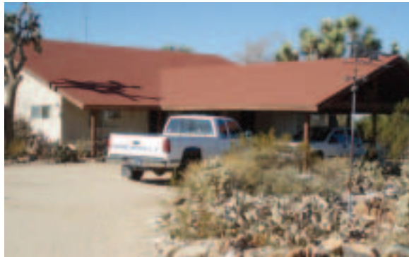
Driveway to the Estate