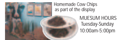
Homemade Cow Chips as part of the display

MUESUM HOURS Tuesday-Sunday 10:00am-5:00pm